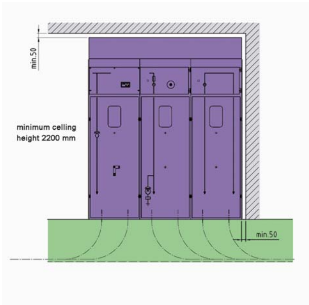
Fig. 1: MV switching cubicle / frontal view