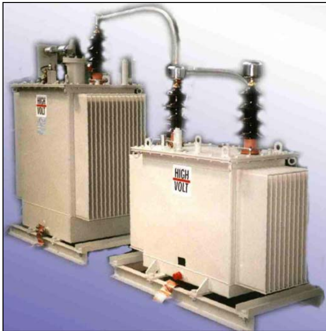
Fig. 1: Tunable metal tank reactor extended by a fixed reactor