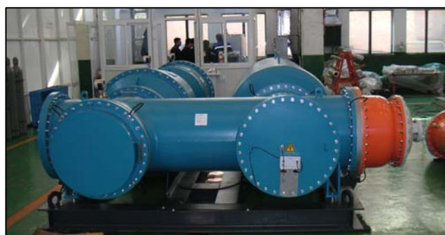
Fig. 6: Test system WRVG 1.9/750 G for factory tests on GIS

Type designation for metal clad, gas-insulated resonant test system of variable frequency is WRVG a/b G, with "a" the rated current and "b" the rated voltage. Example: WRVG 1.5/680 G is a metal-clad, SF 6 -insulated resonant test system with a reactor of 1.5 A and 680 kV.