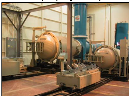
Fig. 5: Test systems WRVG 0.65/1000 G and WRVG 1.5/600 G for GIS spacer testing

Because of C min = C BL , this means for the load range of test objects 0 ≤ C T0 ≤ C BL . For routine tests this is only acceptable, if not too large units are tested. A system type WRVG...G can be better used if a wider frequency range can be applied. This could be done for routine tests if GIS manufacturer and user agree about that. For internal quality tests on GIS components wider frequency ranges are very common (Fig. 5).