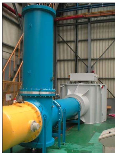
Fig. 3 (left): Metal-clad HVAC test system, type WP 400/800 G for routine testing of GIS spacers

Example: WP 1000/800 G is a metal-clad, SF 6 -insulated test system of 1000 KVA and 800 kV (current 1.25 A).