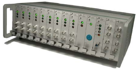
Fig. 3: ICMsys8

The parameters of each channel correspond to that of ICMcompact (Catalog Sheet 6.21).