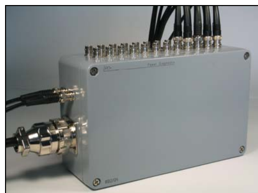
Fig. 2: Multiplexer