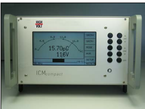
Fig. 1: ICMcompact

Each double channel contains one PD and one voltage channel. The selected measuring impedances must enable both, PD and voltage measurement (types CIL .../V in Data Sheet 6.31). Also the related accessories are used.