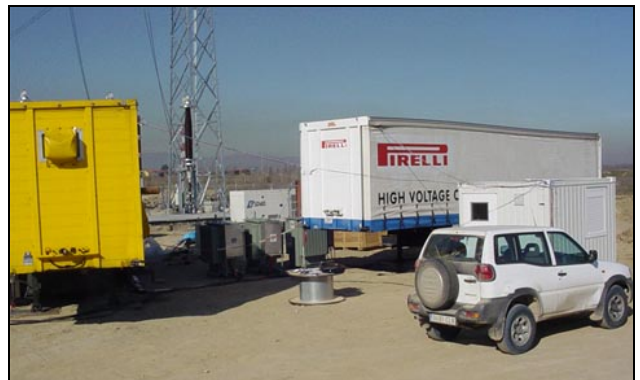
Fig. 5: Trailers on site, connected by fiber-optic links for control