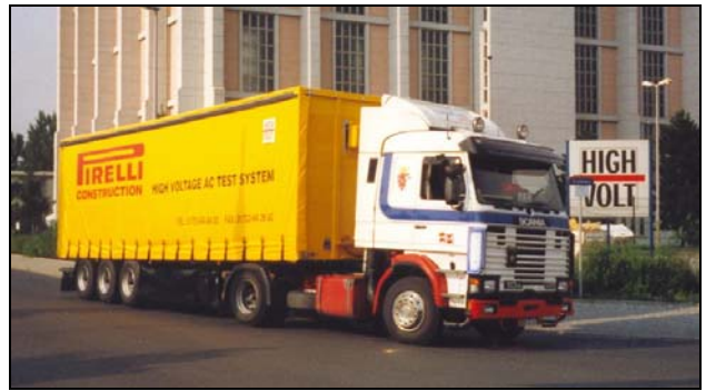
Fig. 4: Trailer on the road