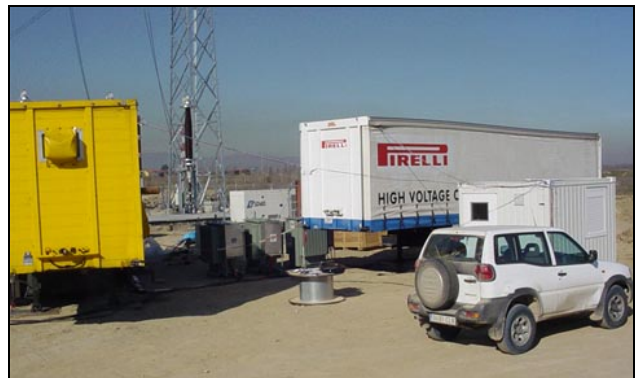
Fig. 5: Trailers on site, connected by fiber-optic links for control