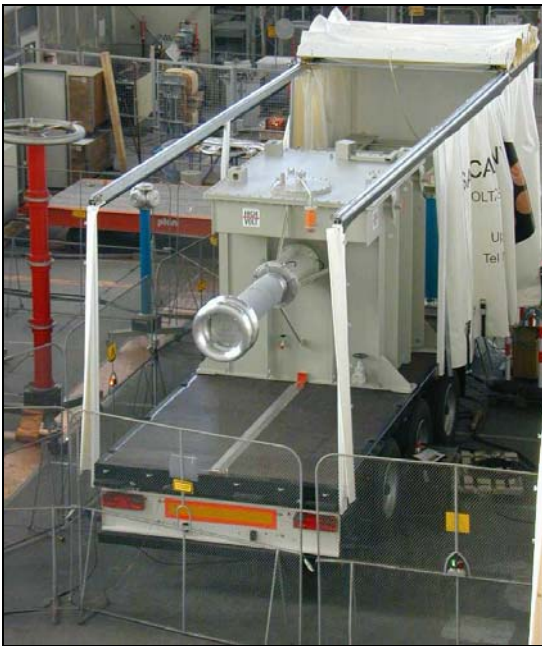
Fig. 3: Trailer with open canvas