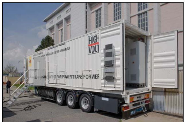
Fig. 6: Container chassis with 40 ft container for transformer test system