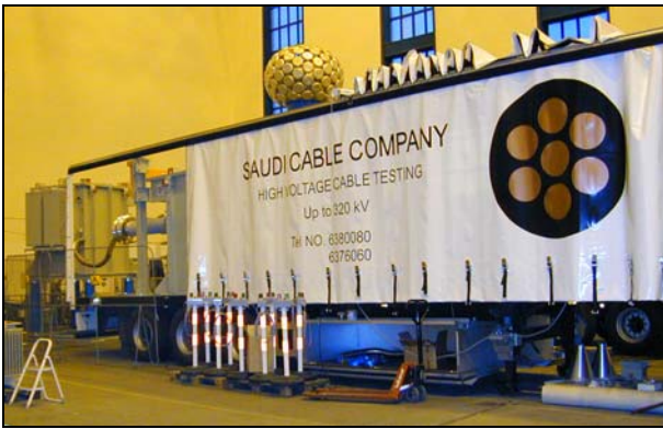
Fig. 2: Trailer with canvas of color and with logo of the client