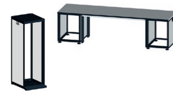
Fig. 6 Housing types: operator rack (left) and operator board (right)