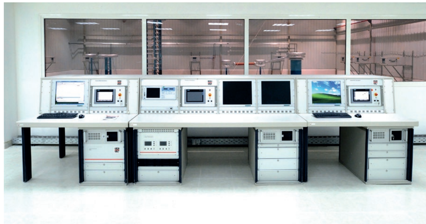
Fig. 7 Control room with operator desks (OD) of a transformer test bay with several high voltage test systems