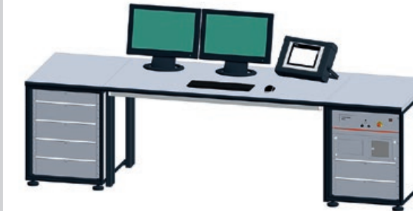
Fig. 2 Operator board containing the advanced control