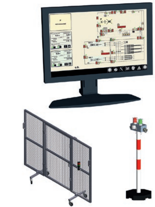
Fig. 5 Safety measures: test bay visualization (top), safety guard (left), safety column (right)