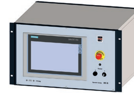
Fig. 1 Operator device HiCO Basic