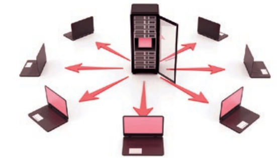
Fig. 4 How the central database works