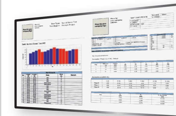
Fig. 3 How the central database works