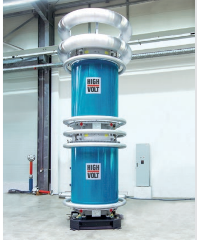
Fig. 2 Modular HVDC test system, type GPM 30/800