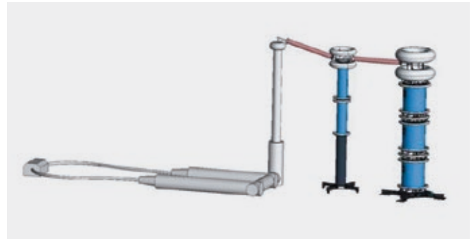
Fig. 4 Discharge device type ERE integrated in high voltage test circuit

Technical parameters are available on request.