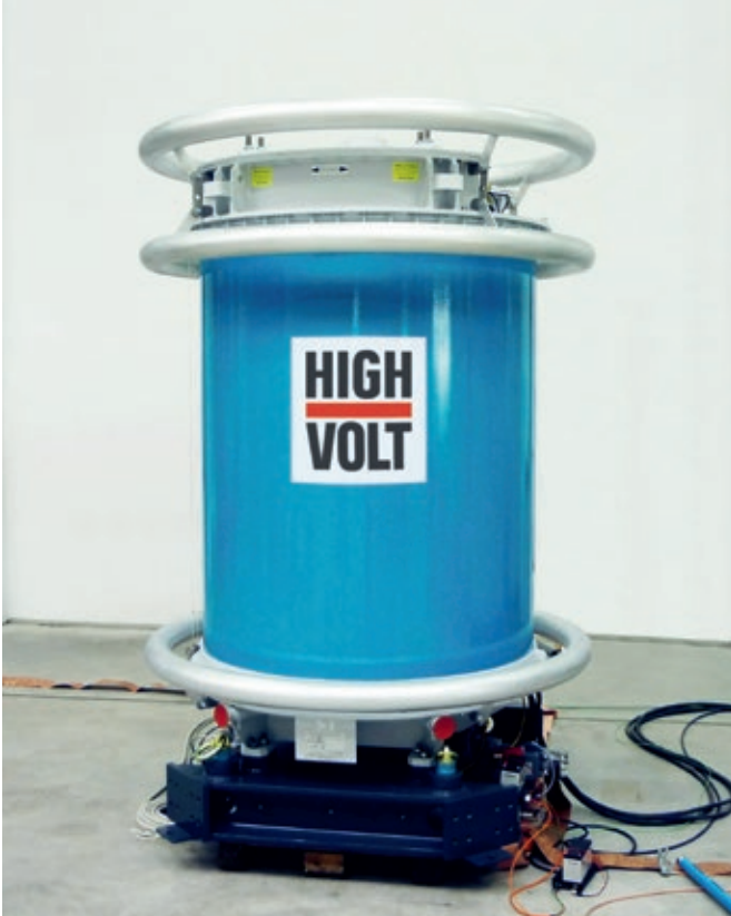
Fig. 1 Modular HVDC test system, type GPM 40/400