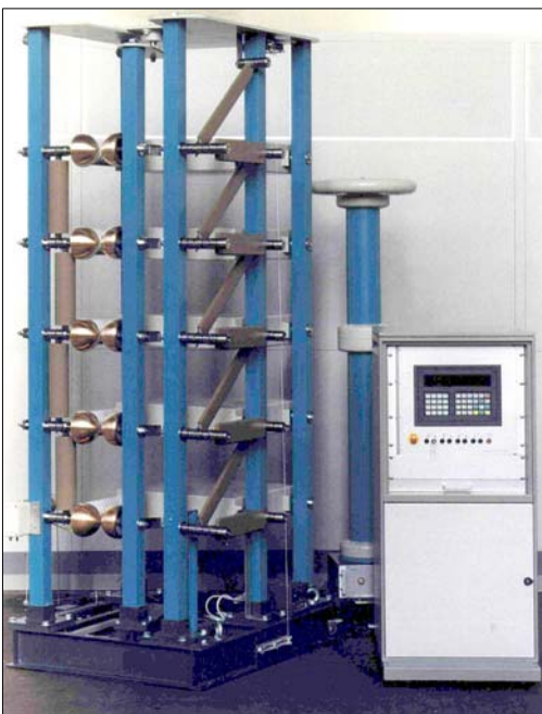
Fig. 1: Impulse voltage test generator IG 10/500 L

Impulse generators with voltages for 1100 and 1200 kV are only stationary systems.