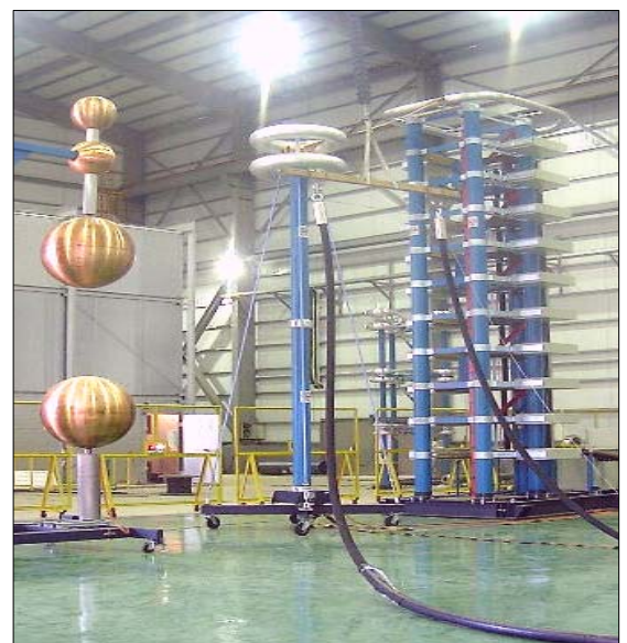
Fig. 1: Impulse voltage test generator IG 200/2000 G