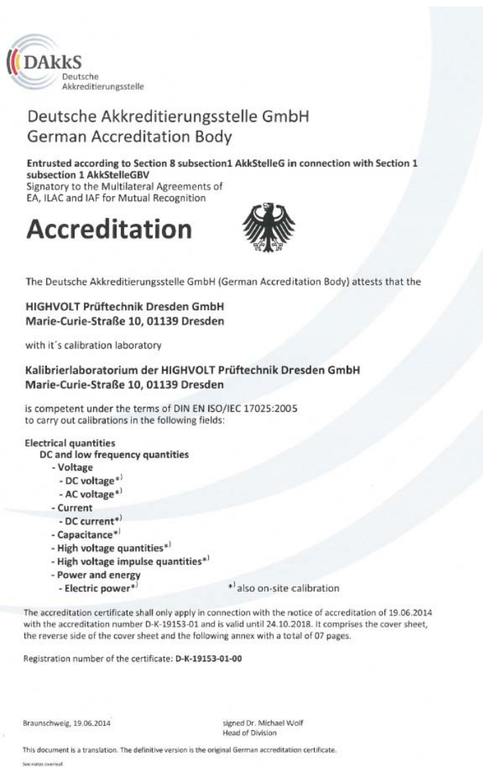
Figure 3: Accreditation (first page)

It is recommended to calibrate the universal resistive/capacitive reference voltage dividers together with the instruments which will be used together with the divider.