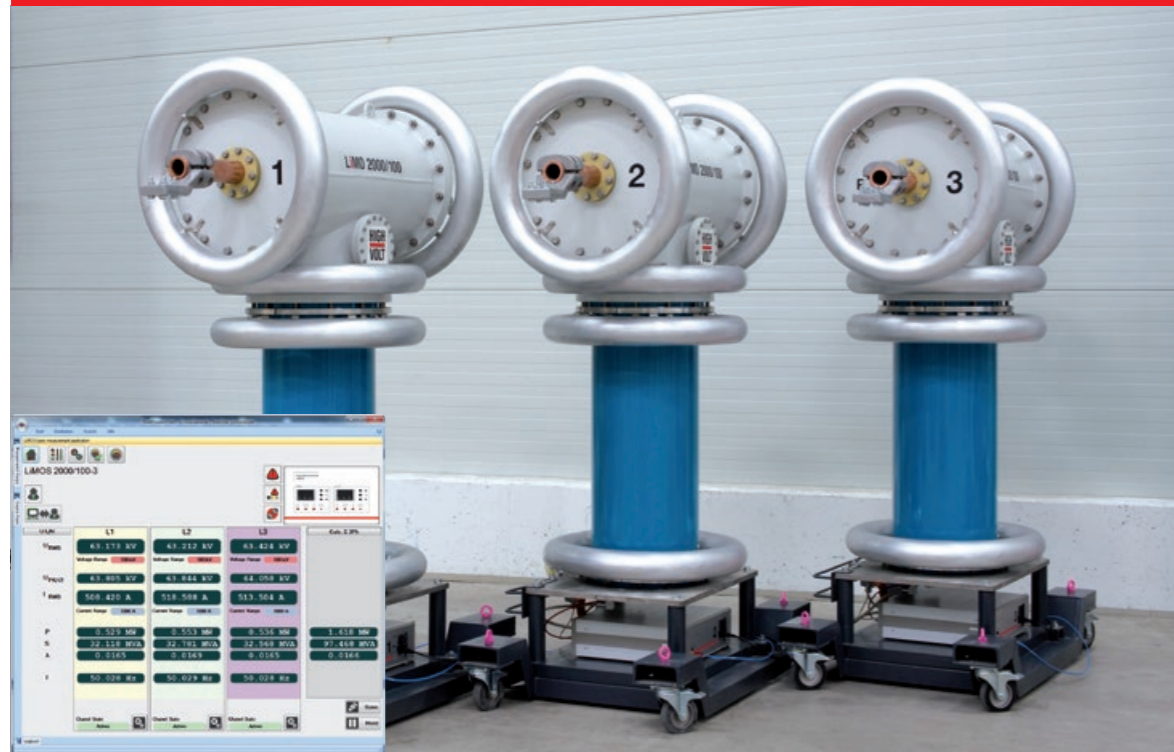
Fig. 1 LiMOS 2000/100 consisting of three sensors with measuring and transmitting units (MTU) and the remote screen