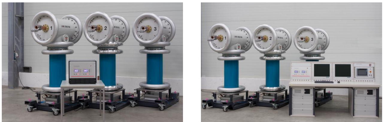
Fig. 2 Transformer Loss Measuring System LiMOS 2000/100-3 (with LiMOS MCSU; left: stand alone, right: integrated into operator desk)